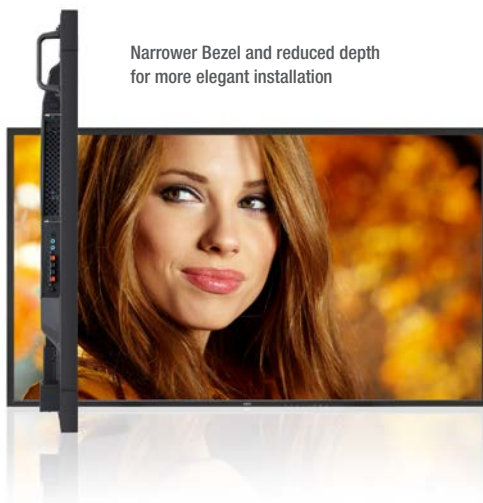
Narrower Bezel and reduced depth for more elegant installation

Incorporating LED backlighting, V Series displays are slimmer and lighter and more environmentally friendly, enhancing establishments with sophisticated style and seamless integration. Reduced product weight improves installation options with more ease and flexibility and decreases shipping costs. Versatile 5 Point Touch and low reflection Protective Glass versions allow for flexible placement and advanced interactivity maximises the visitor experience.