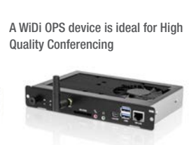
A WiDi OPS device is ideal for High Quality Conferencing