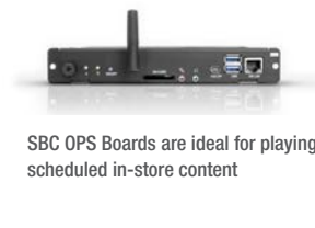
SBC OPS Boards are ideal for playing scheduled in-store content

Future-proof your display with the NEC option slot. This slot provides connectivity for Open Pluggable Specification (OPS)-compliant devices, creating a seamless integration across a variety of accessories.