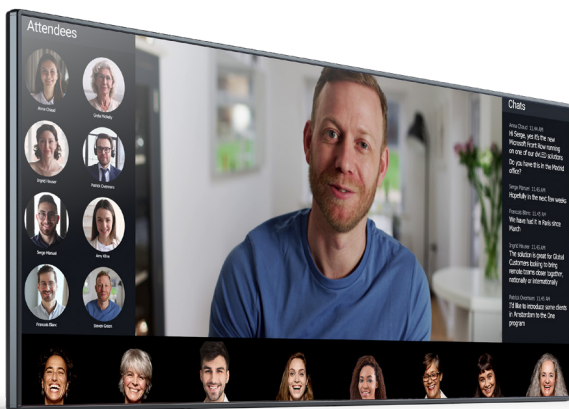
NEC LED-FE009i2-104 0.9 mm Indoor LED UW-FHD Bundle